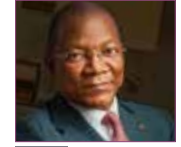
Bruno N. Koné Minister of Construction and Urban Planning Côte d'Ivoire