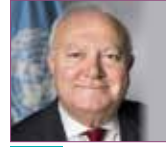
Miguel Ángel Moratinos High Representative for the Alliance of Civilizations, United Nations