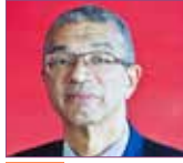
Lionel Zinsou Former Prime Minister of Benin