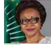
Josefa Sacko Commissioner, African Union, Ethiopia