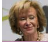
María Teresa Fernández de la Vega President of the Women for Africa Foundation, Permanent Member of the Council of State, Spain