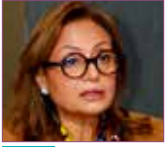
Dr Amani Abou-Zeid Commissioner for Infrastructure and Energy, African Union Commission